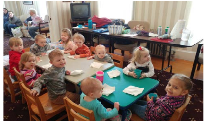
Children enjoy snack at the Hillsborough Better Beginnings Program at Smith Church's Dubben House.

Our Home Visiting program for families is growing and serves as a critical support for families in times of need and crisis.