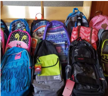
Nearly 200 backpacks were distributed to local elementary, middle, and high school students.