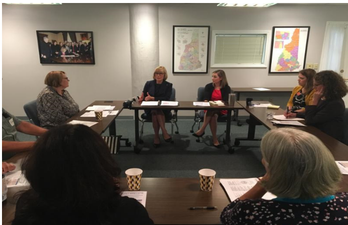
Senator Hassan meets with grandparents and families impacted by the opioid epidemic.