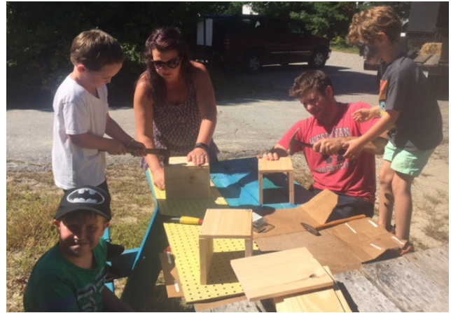
Families learn to make boxes at the Community Tool Lending Shed

Community Tool Lending Shed: The Grapevine's Community Tool Lending Shed is now open! With the support of an anonymous local donor, many volunteers, and tool donations made we have begun lending out tools and offering workshop to learn how to use these tools. The Community Tool Lending Shed is organized by a volunteer committee that offers workshops and facilitates lending tools with community members. If you are interested in learning more about the Tool Shed please email our Tool shed committee at: toolshed@grapevinenh.org