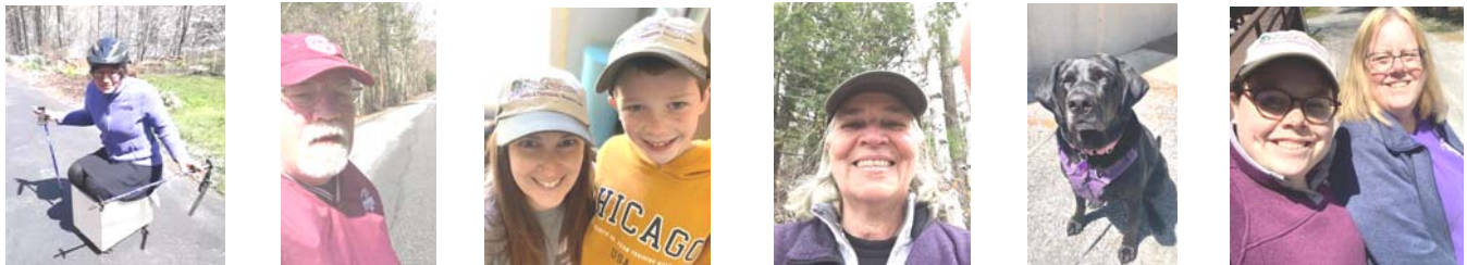
Some of our Virtual Spring Walkers 2020

In Fiscal Year 2019 – 2020, our major financial contributors include: