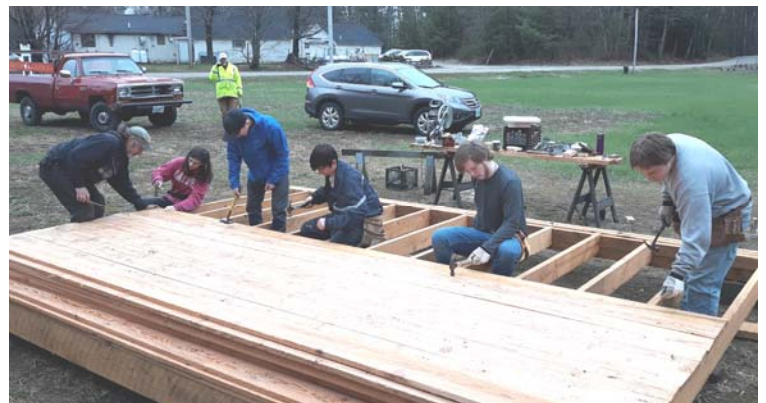
Avenue A teens construct performance stage in Bennington