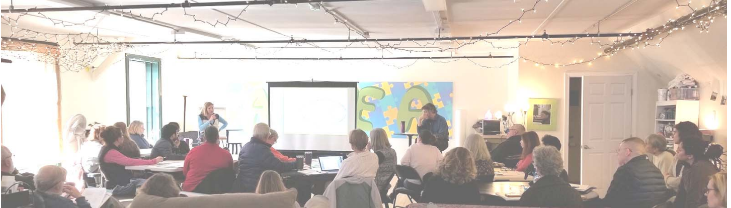
NAMI NH Connect Suicide Prevention program training at Ave A in Antrim

In the fall of 2019 our community lost a young person to suicide. This tragedy shocked and saddened our youth, parents and community. As we grieved, we acknowledged the importance of preventing a loss like this again. The Grapevine partnered with NAMI NH and the Disaster Behavioral Health Response Team (DBHRT) of NH and brought in immediate support and education for our youth and the adults who care for them. We provided mental health support at Avenue A for teens who needed help processing their grief and loss. We convened a community gathering to honor this loss and set a path forward for our community. We created “Tough Stuff” talking groups at our Avenue A Teen Center for middle and high school students, to give them more opportunities to connect and share their feelings and experiences. We offered a full day NAMI Connect Suicide Prevention training, attended by 34 adults who are now trained as “gatekeepers” to recognize signs and symptoms of depression and suicidality. We continue to provide ongoing support for youth to process grief and loss and are planning future Suicide Prevention programs and training.