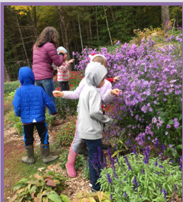
Children participate in the Bugapalooza event cosponsored by The Grapevine & The Harris Center