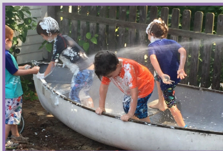
Summer camp fun at The Grapevine