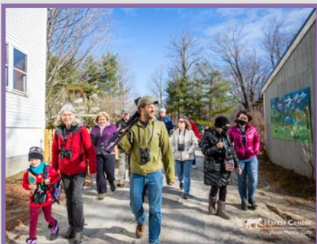
BIRD WATCHING PROGRAM IN PARTNERSHIP WITH THE HARRIS CENTER

These services often act as a “carrot” to getting families more involved with our programs. Sometimes this is as natural as helping a person load wood into the trunk of their car. We ask other questions about what is happening for them and they learn that there are a number of ways that they can get support from us. Having the means as an organization to support basic needs often leads to deeper, more meaningful relationships and connections. In just the first 6 months of 2022 (January - June), we distributed over $18,000 in direct financial assistance to families.