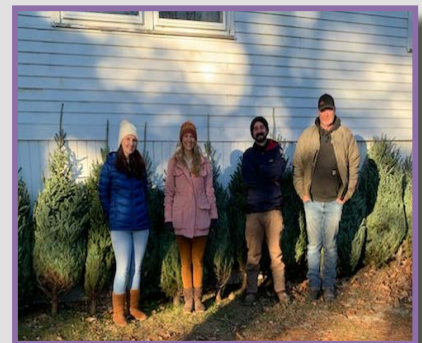
TREE DONATION FROM EVERSOURCE AND JOHN BROWN & SONS

The Masiello Group, Ltd. Monadnock Paper Mills Monadnock United Way MoonRivers Technology Group, LLC NH Charitable Foundation NH Children's Trust NH State Council of the Arts Robin Colson Memorial Foundation Perceptics Foundation Perry Family Dental Town of Antrim Town of Bennington Town of Hancock Town of Hillsborough