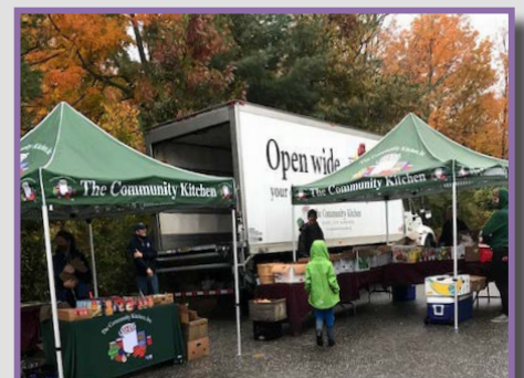
PARTNERSHIP WITH THE KEENE COMMUNITY KITCHEN MOBILE FOOD PANTRY EVENT AT THE GRAPEVINE