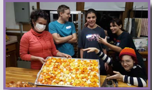
AVENUE A TEENS T.A.C.O. CLUB SERVING FOOD AT THE ANTRIM COMMUNITY SUPPER.

The Grapevine is often called “the place to go when you don’t know where to go”. People from our small, rural community often start here. We can help with emergency needs such as quick access to food, heat, shelter and clothing. This might be in the form of gift cards, paying a bill or emergency repair to a car or home. Our goal is always to get people on the path to more sustainable forms of support. We offer in person appointments to assist with applications for housing, food stamps and other forms of state assistance. We also offer home visits for families who have this need or preference. We recognize that not everyone can come to us, so we try to be flexible with how people access help.