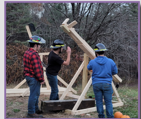
WOODWORKING CLUB PUMPKIN CATAPULT CONTEST

For the past two years, the Grapevine has embarked upon a journey to understand how we can enrich our organization and continue to reach new people and build relationships within our community. Board and staff leaders have enrolled in training to learn and in turn, identify new opportunities for the organization.