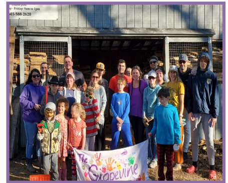
2023 WOOD STACKING PARTY