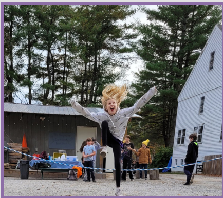
AVENUE A CLUB FOR MIDDLE SCHOOLERS

We run a diverse array of programs based on teen requests—from cooking to outdoor adventures, manga art, creative writing, woodworking & carpentry, and more. Last year we partnered with Connected Families NH to pilot “Pizza Talk”, a discussion-based program where teens talk about life over weekly meals together. Their weekly meetings are facilitated by students from Antioch University’s Psychology Doctorate program. The program was so successful that we’re running it again this year, with expanded sessions. We are proud of the work we do at Avenue A in support of teens and their families and are grateful for the support our community to keep it going!