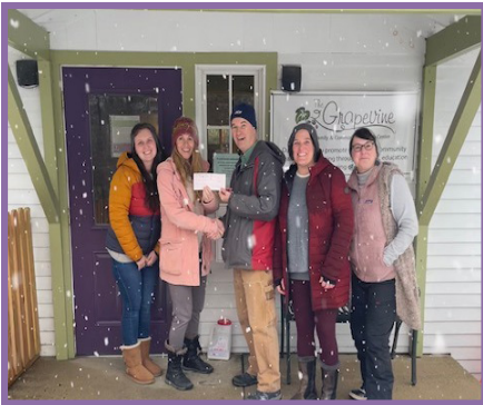
EDMUNDS ACE HARDWARE DONATION FROM LADIES NIGHT EVENT