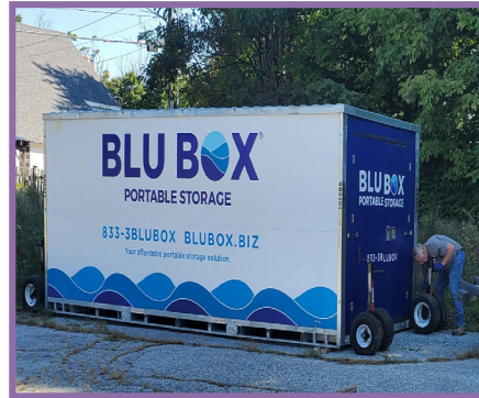
BLU BOX DONATION FOR TEMPORARY STORAGE