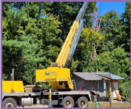
ROBBLEE TREE SERVICE MOVING OUR TOOL SHED