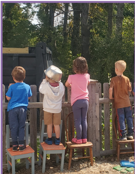
LEARNING VINE PRESCHOOLERS ENTHRALLED WITH CONSTRUCTION ACTIVITIES!