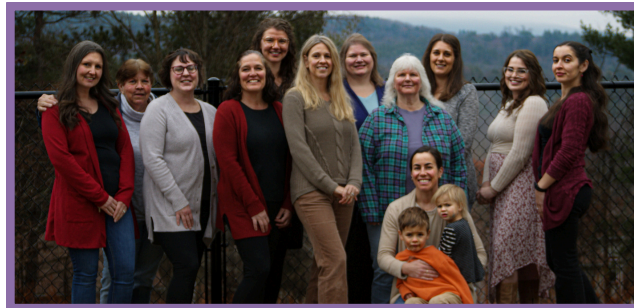
Some of our amazing team members!