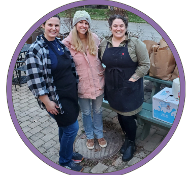
Fresh Food Pickup from our Friends at Fiddleheads Cafe & Hancock Market!

There are many ways to give to your community and the Grapevine!